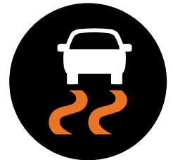
ELECTRONIC STABILITY CONTROL