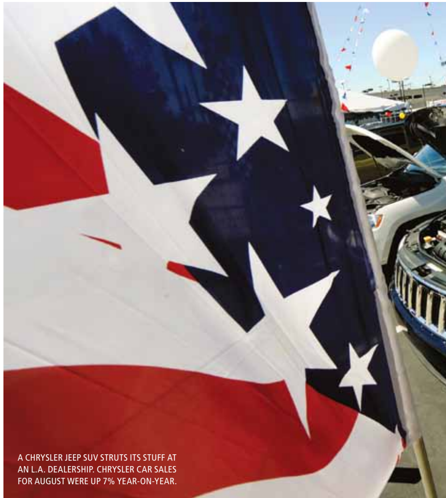
A CHRYSLER JEEP SUV STRUTS ITS STUFF AT AN L.A. DEALERSHIP. CHRYSLER CAR SALES FOR AUGUST WERE UP 7% YEAR-ON-YEAR.

the driving force behind consumer interest in new cars at the moment—innovations beyond headline-grabbing EVs (electric vehicles), lithium-ion batteries, plug-in/gas-electric hybrids and charging stations. Vehicles such as Toyota's Prius, GM's Chevy Volt, Nissan's LEAF, Ford's Transit Connect electric van and the Ford Focus Electric deserve the ink, because they do, indeed, represent the biggest shift in 100 years in how vehicles are powered. But what car shoppers are really getting hooked on are the technologies and cutting-edge mash-ups that are radically transforming the car and driving experience affecting the very ways we drive, park and see the road, to how we communicate and