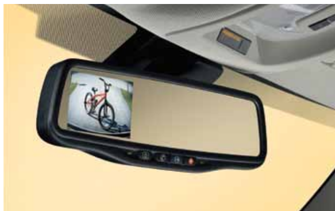
A REAR-VIEW CAMERA IN THE 2011 CHEVY EQUINOX DISPLAYS IMAGES ON A MONITOR CONCEALED IN THE REAR-VIEW MIRROR.

by their systems rather than the driver, last-resort automatic steering intervention, cars that see the future (or at least the bend in the road that you can't yet see), vehicle-to-vehicle and vehicle-to-infrastructure communication (like traffic-sign recognition and more), fully automated parking functionality and much more. The real shocker is that these sorts of uber-sophisticated technologies don't feel like much of a reach anymore.